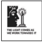
Victoria Blind School Mumbai