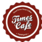
Times Cafe Group Vadodara | London | Pune